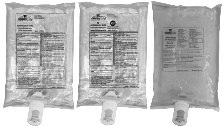
750110 Antibacterial Soap 1100ml

Specialized formulation contains 0.5% Triclosan for 99.9% germ kill against gram positive and gram negative bacteria common found in food service and healthcare environments. Helps reduce the risk of cross contamination and meets the E2 requirements for food preparation areas. Rinses off easily. pH balanced. Fragrance free & dye free. Clear.